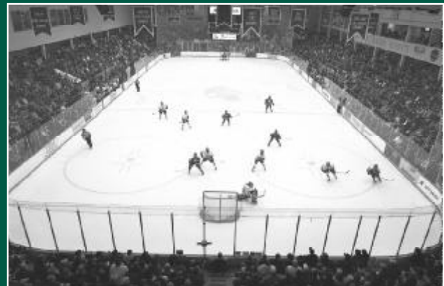
Figure Skating Camp at Cheel Arena from July 7- August 9th. Contact 315-268-7750 for more information.

A Cheel Arena record crowd of 4,125 turned out on a brisk winter evening to watch one of college's hockey's fiercest rivalries on January 18. The Golden Knights hosted Route 11 neighbor St. Lawrence in one of three games televised live from Cheel by Time Warner Cable in January, but unfortunately for the Green and Gold faithful Clarkson fell to the Saints 3-2.