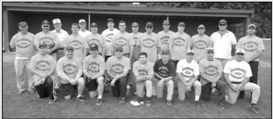
2003 CLARKSON BASEBALL ALUMNI