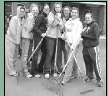
Clarkson Women's Basketball

Clarkson University Athletics was well represented in the Village of Potsdam's Annual Community Clean-Up this spring. Clarkson's Student Athletic Advisory Committee (S.A.A.C.) representing over 150 Golden Knight student-athletes along with coaches participated on a Saturday morning, picking up trash, raking, and sweeping sidewalks throughout the village.